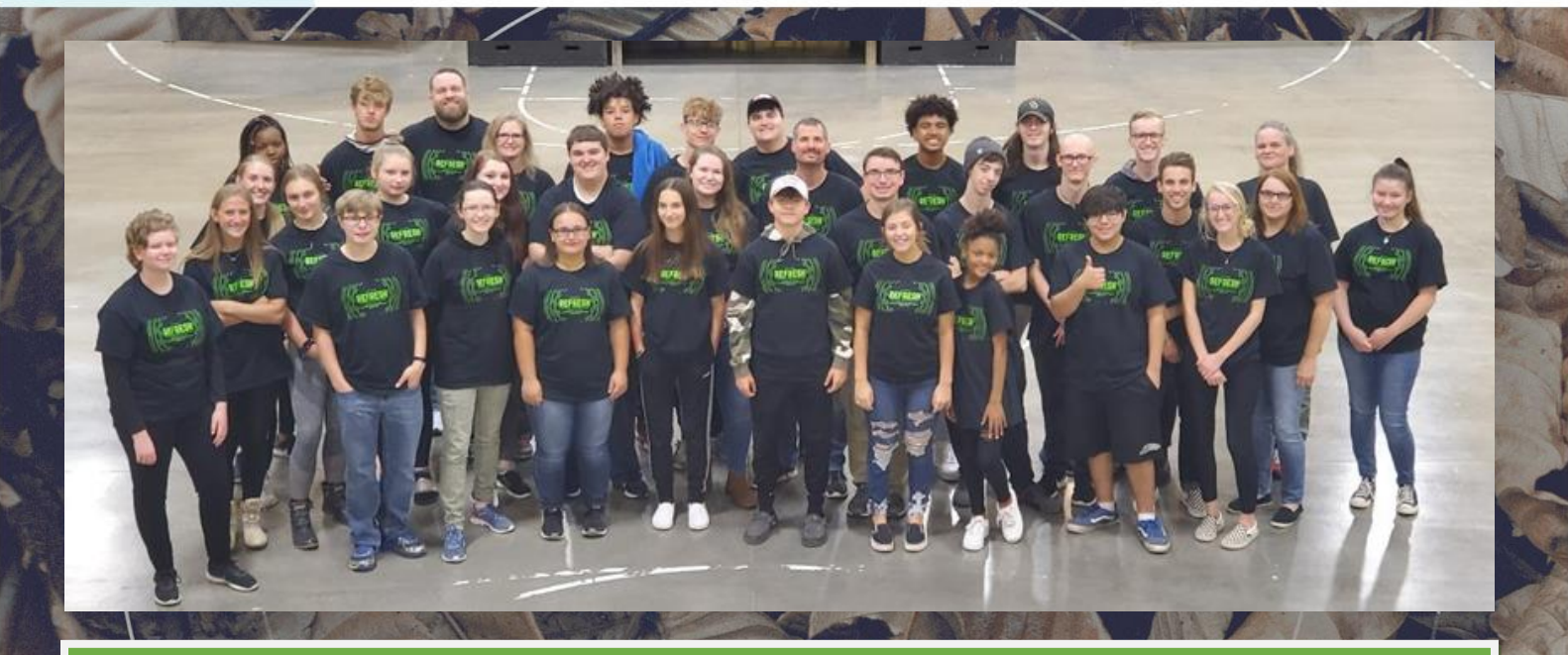
October 16 – 18, 2020 REFRESH Retreat Participants

This weekend was the best thing that has happened to me. I've felt more like a Christian after the services and prayer time. (continued on next page)