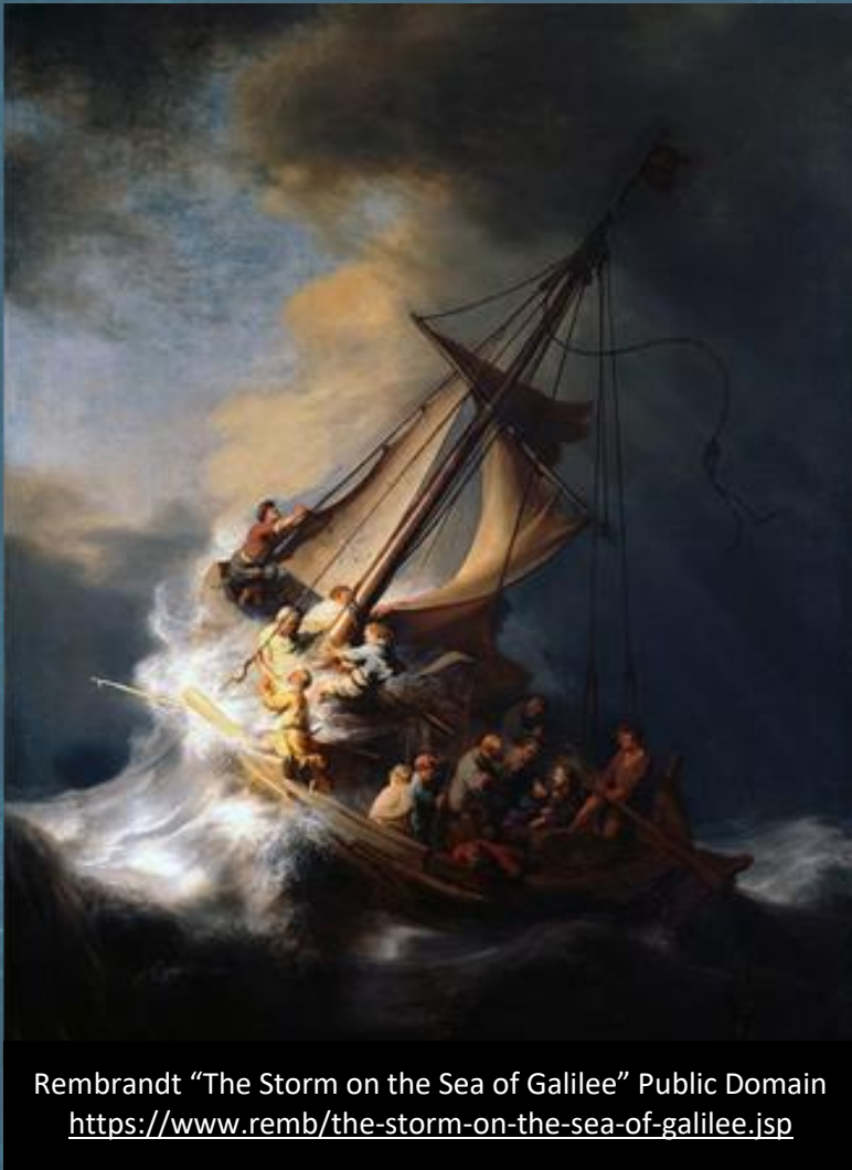
Rembrandt "The Storm on the Sea of Galilee" Public Domain https://www.remb/the-storm-on-the-sea-of-galilee.jsp

3:00-5:00pm Teen Quizzing 5:00-7:00pm R!OT Youth Meeting