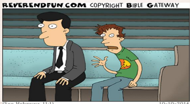
IF THE SUBSTANCE OF EVERYTHING THAT I HOPE FOR IS A GIRLFRIEND ... THEN WOULD HER NAME BE FAITH?