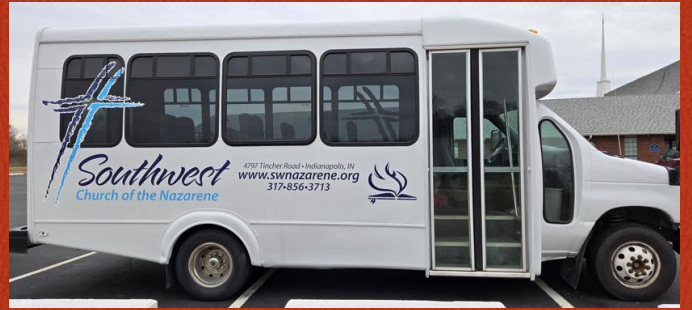
Check out the new Southwest Church Bus – new paint & graphics!